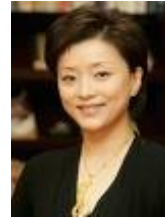
Yang Lan Co-owner China Sun Television Cybernetworks