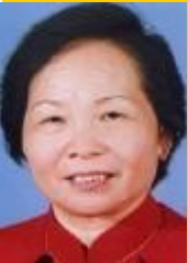
Hon. Nguyen Thi Doan Vice President