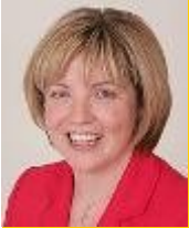
Hon. Mary Coughlan Deputy Prime Minister and Minister of Enterprise, Trade, and Employment Ireland