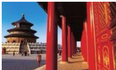
Temple of Heaven