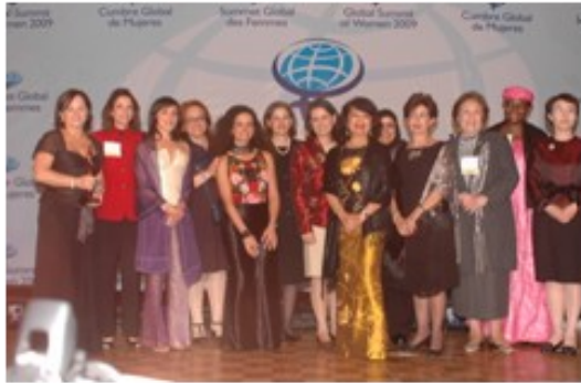
Women ministers from five continents gather on stage at the 2009 Summit Gala Dinner in Santiago, Chile.