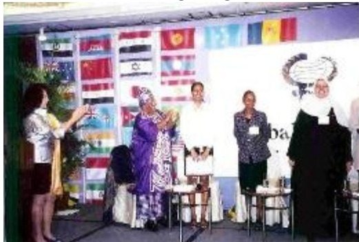
Young women entrepreneurs at the 2001 Summit in Hong Kong, China.