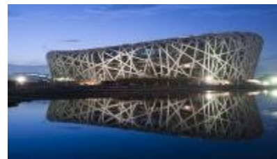
Olympic Bird's Nest