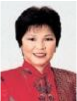
Datuk Seri Dr. Ng Yen Yen Minister of Tourism Malaysia