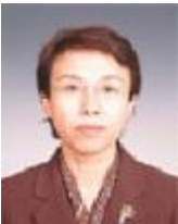
Hong Cheng Deputy Mayor Beijing