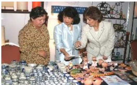
2005 Summit WEXPO vendors in Mexico.